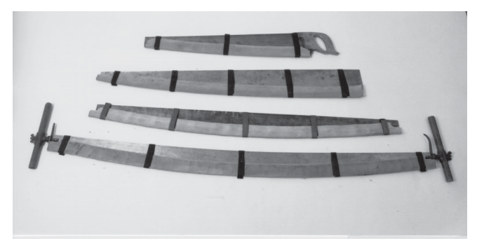
Figure 2—Crosscut saw guards properly applied using 1-1/2-inch fire hose. Velcro-style fasteners secure the straps.

Flexible crosscut saw guards should be made from a section of discarded 1112-inch rubber-lined hose that is still in good condition. The attachment straps should be made from 1-inch nylon webbing sewn to the guard. Velcro-style fasteners (or other secure fasteners) should be sewn to the straps to secure the guard to the saw.