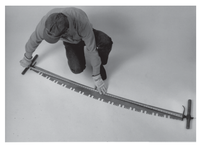
Figure 3—Measuring the total length of the saw across the cutters.

1. Measure the total length of the saw across the cutters (Figure 3).