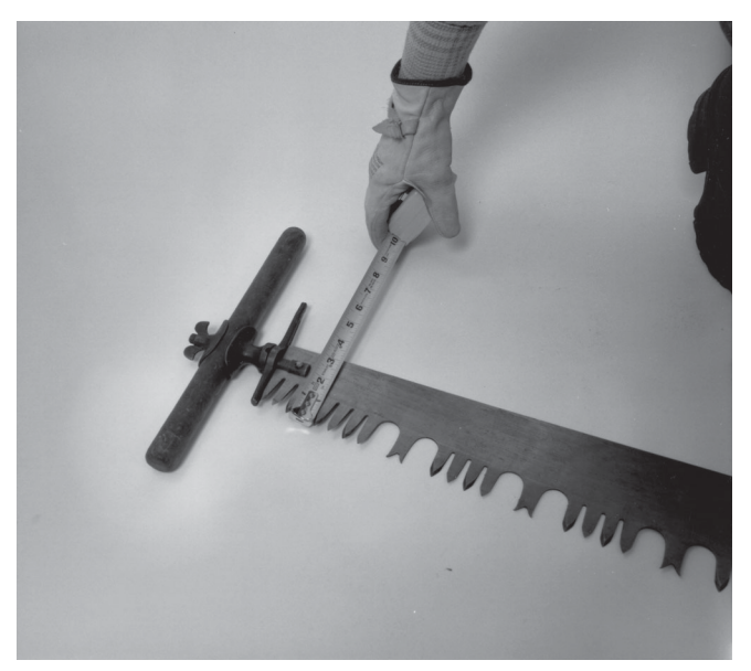
Figure 4—Measuring the width of the saw from the cutters to the back.

2. Measure the width of the saw (Figure 4).