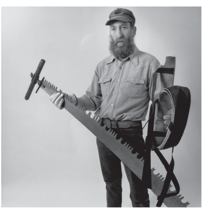
Figure 7—The sawguard is rolled and ready to be applied to the saw.