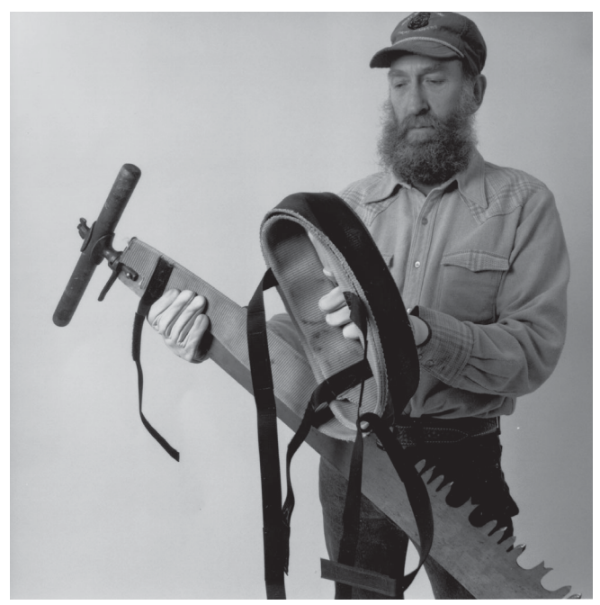
Figure 8—Unrolling the sawguard along the saw's cutters.