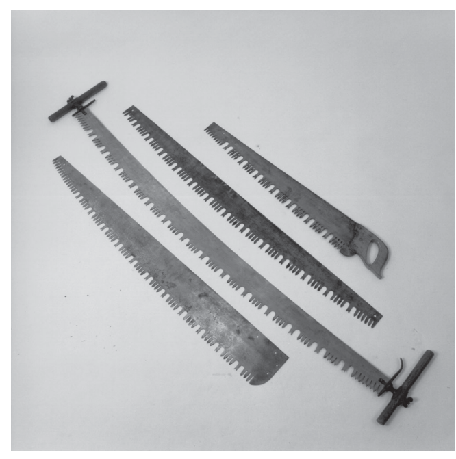
Figure 1—Several different styles and lengths of crosscut saws.

MTDC originally investigated designing flexible plastic guards for crosscut saws similar to the guards that are available for shovels and pulaskis. Plastic guards proved to be impractical because there are so many different types and sizes of crosscut saws. Oneperson saws may be from 3 to 6 feet long and twoperson saws may be from 4 to 12 feet long. Twoperson saws are also available in two basic patterns, the felling saw, which has a concave back, and the bucking saw, which has a straight back (the back of the saw is opposite the toothed edge). Many tooth patterns are available. The most commonly used patterns include the lance tooth, perforated lance tooth, and champion tooth patterns. Because so many different styles and sizes of saws are available, guards need to be custom fitted for individual saws (Figure 1).