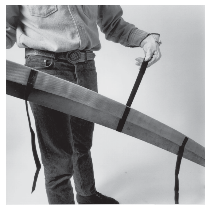
Figure 9—Make sure that the Velcro-style fasteners are lined up and that the straps are tight.