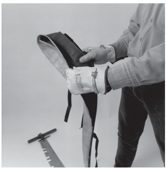
Figure 6—Rolling the sawguard. The roll should be about 1 foot long.

pointing up. With the folded guard in your left hand, apply the guard to the cutters (Figure 8). Roll the folded guard down the crosscut saw until all the cutters are covered. Once you are sure that all the cutters are in the center of the guard, wrap the securing straps around the saw, starting with the center strap and working to either end. Make sure that the Velcro-style fasteners are lined up and the straps are tight (Figure 9).